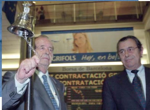
May 17 2006. GRIFOLS IPO in the Barcelona Stock Exchange